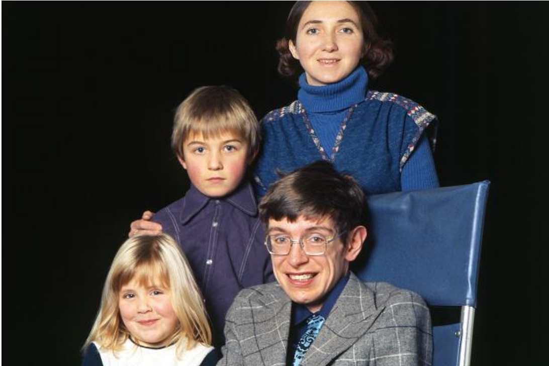
Stephen Hawking with family, 1978 (ref.1)

Stephen Hawking is widely considered as the most brilliant theoretical physicist since Einstein. He might also be one of the greatest thinkers of our time, and certainly a most persistent and courageous one in coping with several obstacle in his life including illness.